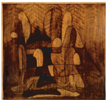
Fritz Winter «Ohne Titel». Wood relief, poker work, 1933. Monogrammed and dated on the lower right. 78 x 84 cm.