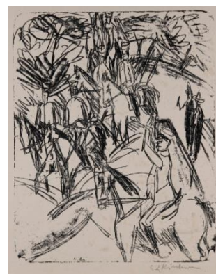
Ernst Ludwig Kirchner «Flussübergang der Reiter». Lithography on satined chamois paper, 1915. Dube L 301 I. 1 of 5 prints by the artist. 26,8 x 21,4 on 35 x 32 cm. Signed on the lower right with pencil.