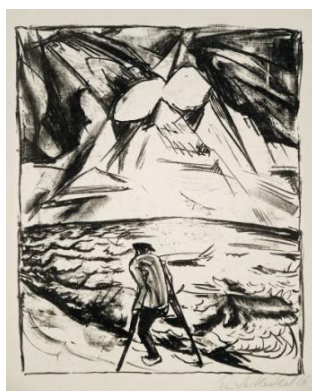
Erich Heckel «Krüppel am Meer». Lithography on ripped chamois handmade paper, 1916. Dube L 236 IV. Signed and dated on the lower right. 26,2 x 21,5 on 51 x 35,2 cm.