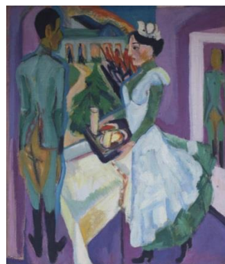
Ernst Ludwig Kirchner «Offizier und Kellnerin». Oil on canvas, 1915. Gordon 431. With the estate-stamp on the verso. 95 x 82 cm.