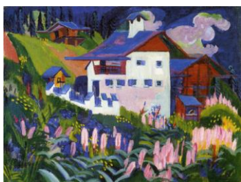
Ernst Ludwig Kirchner «Unser Haus; Haus in Wiesen». Oil on canvas, 1920/1922. Gordon 631. Signed on the lower right. 90 x 120 cm.